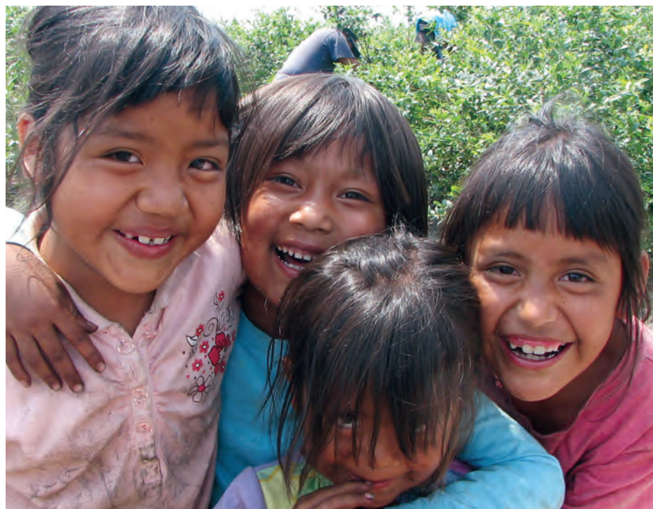
Association of Farmworkers Opportunity Programs

I n demanding a future that transforms society to ensure equality of opportunity and respect for life, we support the leadership of Black Lives Matter in advancing systemic and institutional change in how we value each other. As an environmental and public health organization, Beyond Pesticides seeks to ensure that we put a stop to disproportionate harm to people of color because of racism and inequality. We strive for a sustainable world that, in a true sense, can only be achieved with foundational change to our social, economic, and environmental norms. In this context, we stand with those demanding an end to systemic racism, white supremacy, and violence in society, and call for a social structure and law enforcement system that honors this goal.